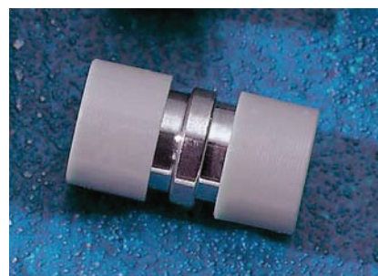
Trident HPLC Guard Cartridge