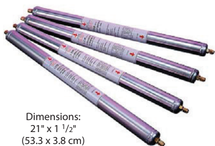
Dimensions: 21" x 1 1/2" (53.3 x 3.8 cm)