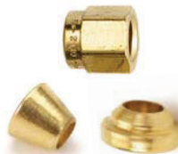
nut & ferrule set