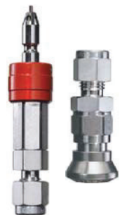
male & female quick couplings