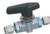
ball valve, 2-way