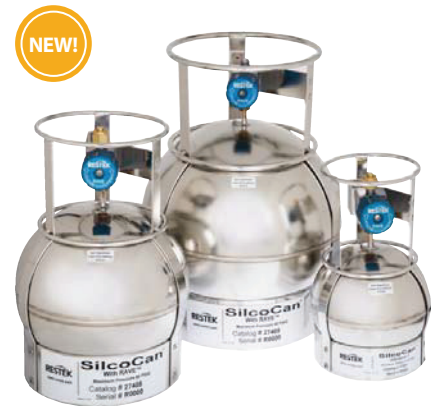
Canisters are the gold standard for ambient VOC sampling.

Whether you are sampling for TO-14A, TO-15, or reactive sulfur compounds, SilcoCan® canisters are your best choice for inertness. In Tedlar® bags, the stability of low-level (100 ppbv) sulfur volatile organic compounds (VOCs) is poor, even within 24 hours of sampling. Sulfur compounds react with the metal surface in electropolished canisters, so they are unsuitable for collecting and storing low-level sulfur VOCs. SilcoCan® air sampling canisters, which feature a Siltek®-treated surface, offer excellent storage stability for sulfur VOCs at very low levels (5–20 ppbv), under dry or humid conditions. The versatility of the SilcoCan® canister makes it an excellent choice for collecting and storing TO-14A or TO-15 compounds.